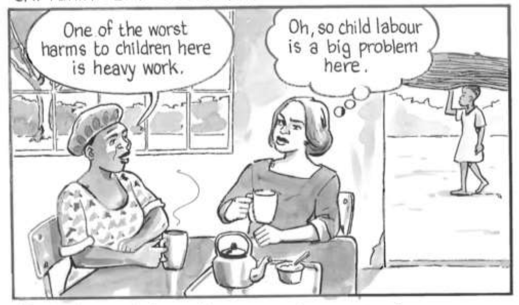
Do both people have the same understanding ?

Of course, narrative methods have significant limitations. If we wanted to know how much violence against children actually occurs, narrative methods might not yield the most accurate information. Parents may underestimate how often or how severely they beat their children, since factual information about that could threaten their image of being good parents who care for their children and avoid cruelty.