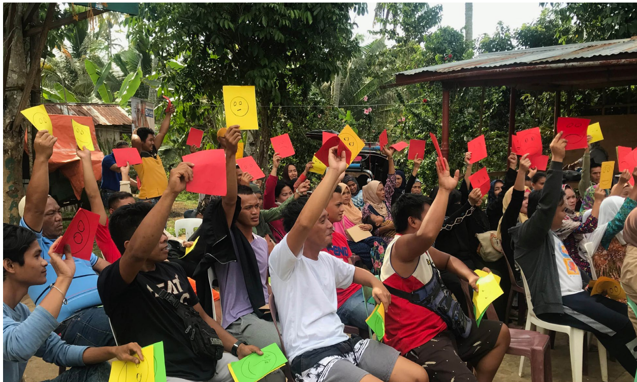
The Alliance for Child Protection in Humanitarian Action (2020).

Below is a sample scorecard. Contextualize it to meet timeframes agreed on or add other standards that communities wish to apply. Adapted from Plan International's Program Quality, Impact, and Accountability Toolkit.